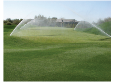
Use of calcium in sodic soils prevents soil clogging and improves water infiltration.

Second, adding too much gypsum by itself to saline or sodic soils that already contain calcium can produce an explosion of sodium sulfate, which is in itself a salt and can be more toxic to plants than the pre-existing salts. Calcium replaces exchangeable sodium on the soil particles forming sodium sulfate as a by-product and increasing the exchangeable calcium in the soil. Since the solubility of sodium sulfate is about 20 times greater than calcium sulfate, sodium sulfate can render the soil highly saline. Wallace emphasizes the importance of soil testing prior to application of amendments so that the correct balance can be achieved. Once that is determined, in most cases a combination of gypsum (for quick release) and anhydrite (for slow release) is recommended.